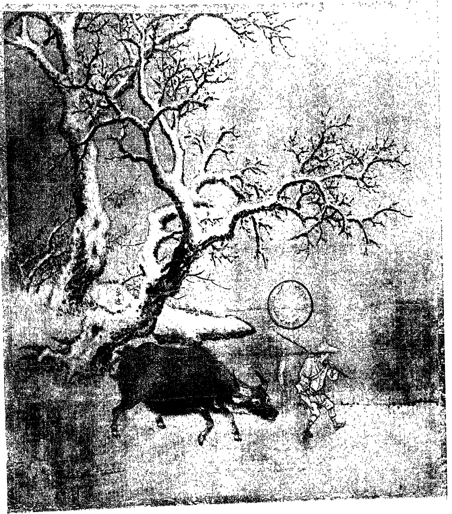
XII PAINTING BY LI-TI SUNG DYNASTY